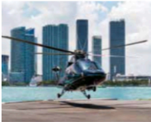
ABOVE AND LEFT: HELIFLITE OFFERS PRIVATE COMMUTER HELICOPTER SERVICE.

even Key West faster than it might take you to fill up on gas. Afternoon at Disney? Beach day in Longboat Key or the Bahamas? You can fly in one of the company's 15 twin-engine, dual-piloted, executive cabin-class helicopters to anywhere within a 250-mile radius of its bases in Miami, Opa-Locka, and Palm Beach. The fact that HeliFlite was regularly featured on HBO's Succession —and counts C-suite executives and celebrities we're not at liberty to name as frequent flyers—speaks to its luxury, safety, and discretion. Fees begin at $5,450 per hour but vary depending on route. ( heliflite.com )